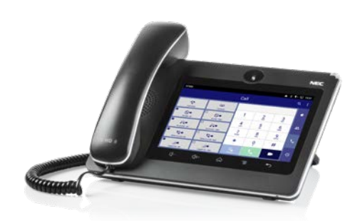
GT890: IP Desktop Video Telephone

Color: Easy call control from the office, remote or home-based working, hot-desking