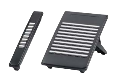
8-line Key Module / 60-line DSS Console