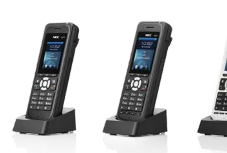
DECT handsets: for any working environment